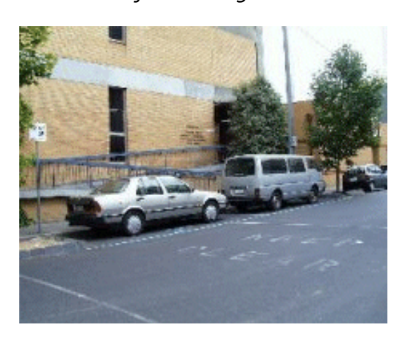
Disabled Parking on Regent St within 50m of Bolte Wing

There is also an undercover car park below the Inpatient Services building accessed via Fitzroy St. Charges apply.