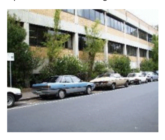
Disabled Parking on Princes St within 50m of Bolte Wing

Disabled parking spaces are also available in Princes Street, adjacent to the Bolte Wing and Regent St (which runs parallel to Nicholson St), next to the Inpatient Services Building.